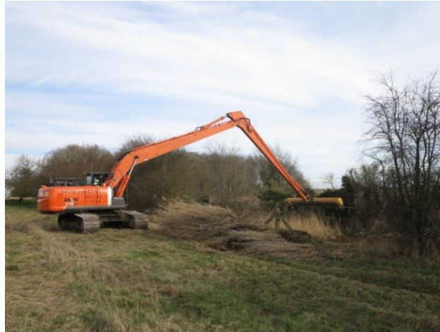
North Level IDB Working on EA Main River