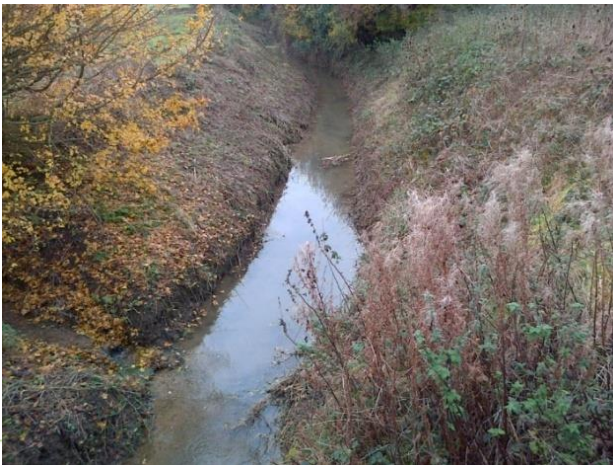
Black Sluice IDB Emergency seal of tidal sluice (Dec 2013)